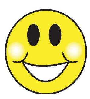
#51 - Movies @ The Lou Survey